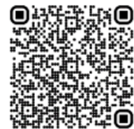
QR Code for Bible study materials