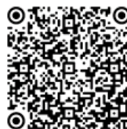
QR Code for Enrollment

Witness Sharing, Bible Study, Q & A session, Prayers